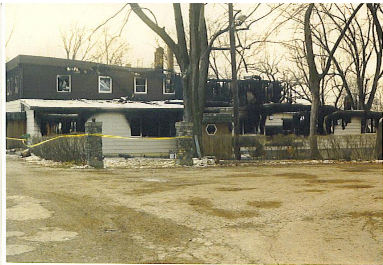
ii marchuk 1992 dec 2 FRONTview looking SOUTH