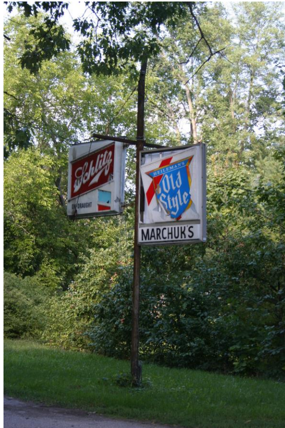
ii IMG_0438 marchuks gateway sign 8-24-2005 6-39-29 AM 2304x3456

~ 1992 December 2 1992 A fire takes from the Lakes, a well known eatery - Marchuk's - and community presence.