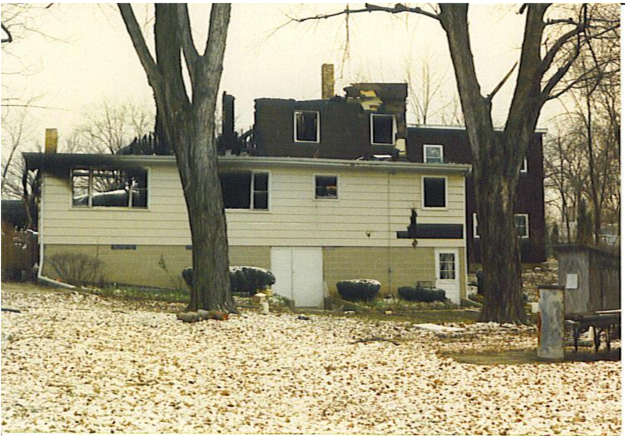
ii marchuk 1992 dec 2 FULLwestSide View