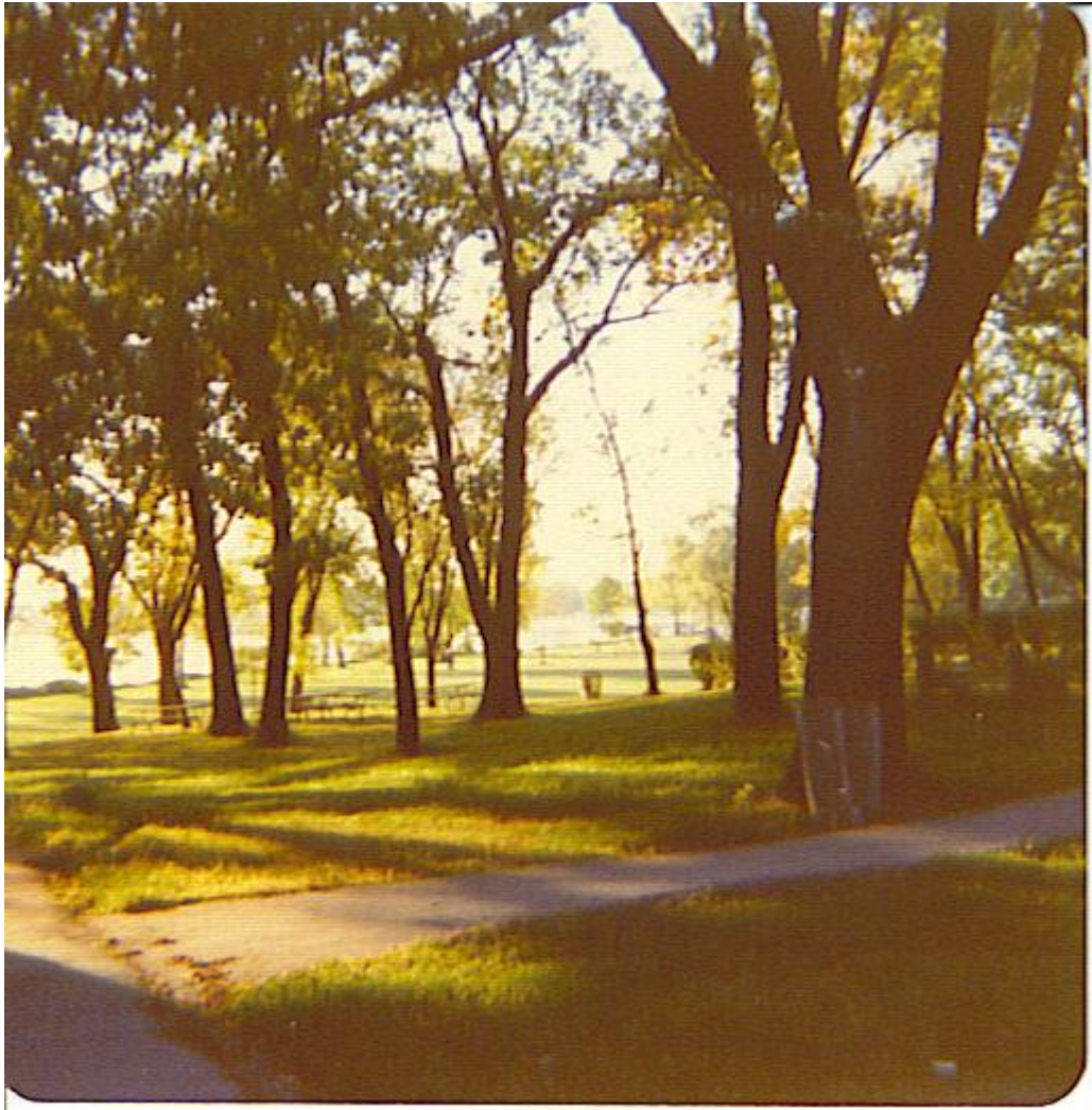
ii marchuk fromMainEntranceTOlakeShoreBushesSeparataingResidence