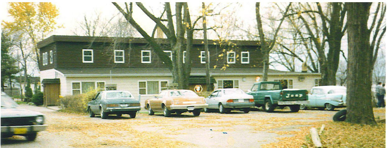
ii Marchuk PRE 1992 dec 2 A