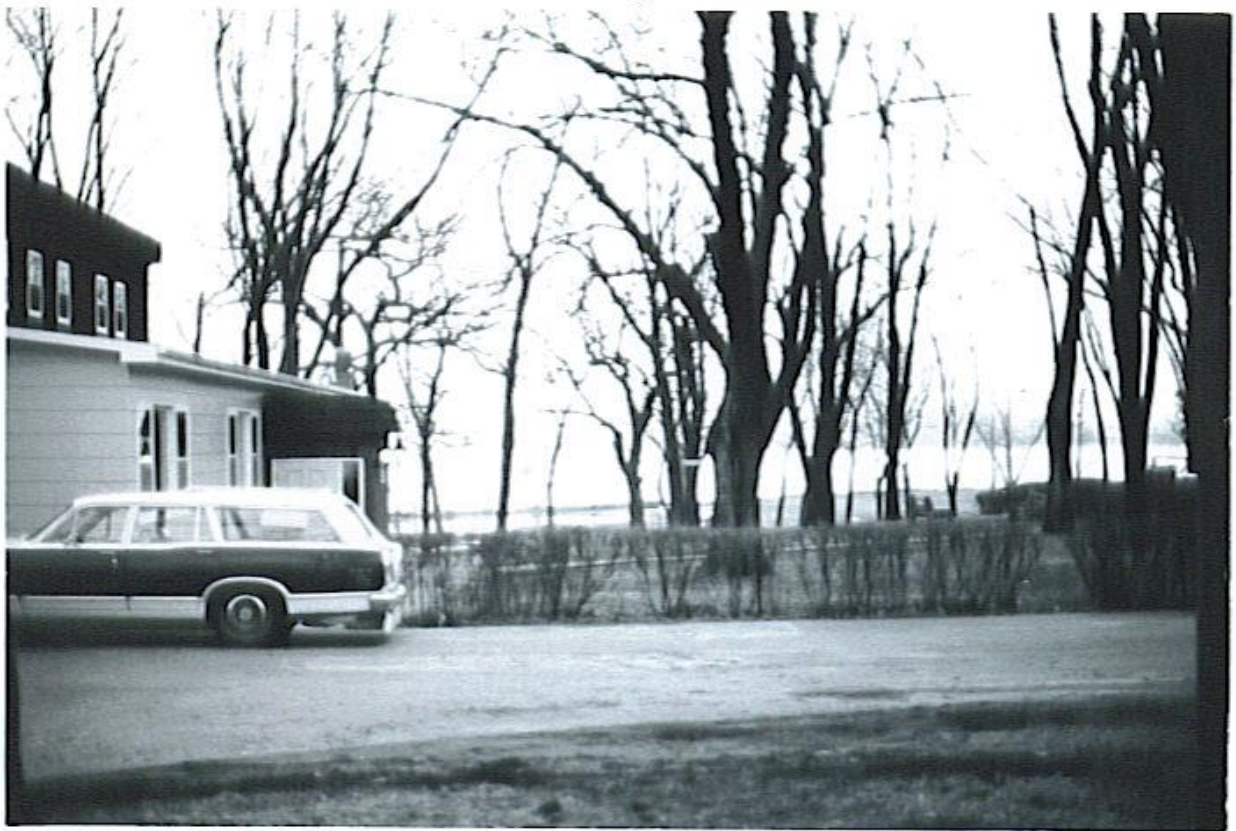
ii marchuk pre1992looking at main entrance westerly to the lakeshore