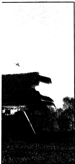
being razed

own, he said, the remainder of the lodge is still structurally sound, even though it dates back to the 1850s.