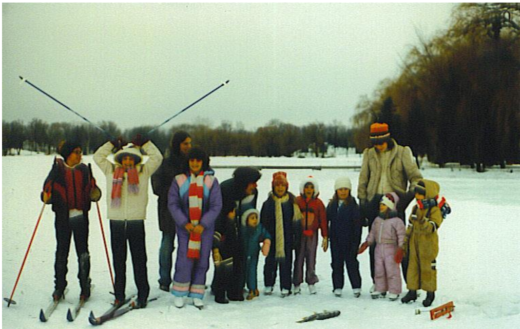
ii JCR Iceskatingand CrosscountrySkiing on Center LakeMANOR 1960s apx