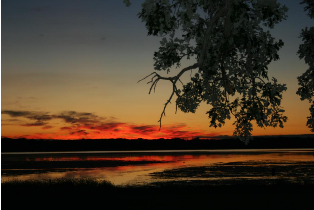
ii IMG_0444 sunset on camp lake 8-24-2005 10-05-20 AM 3456x2304

meeting required continuation to November 4 1989. CCLRD1-96, CCLRDM-67, CCLWE-8