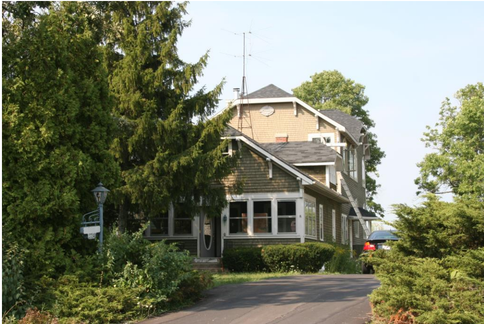
IMG_0223 conrad house the GREEN house on SA at center lake MANORside of the tracks 8-10-2005 6-04-17 AM 3456x2304