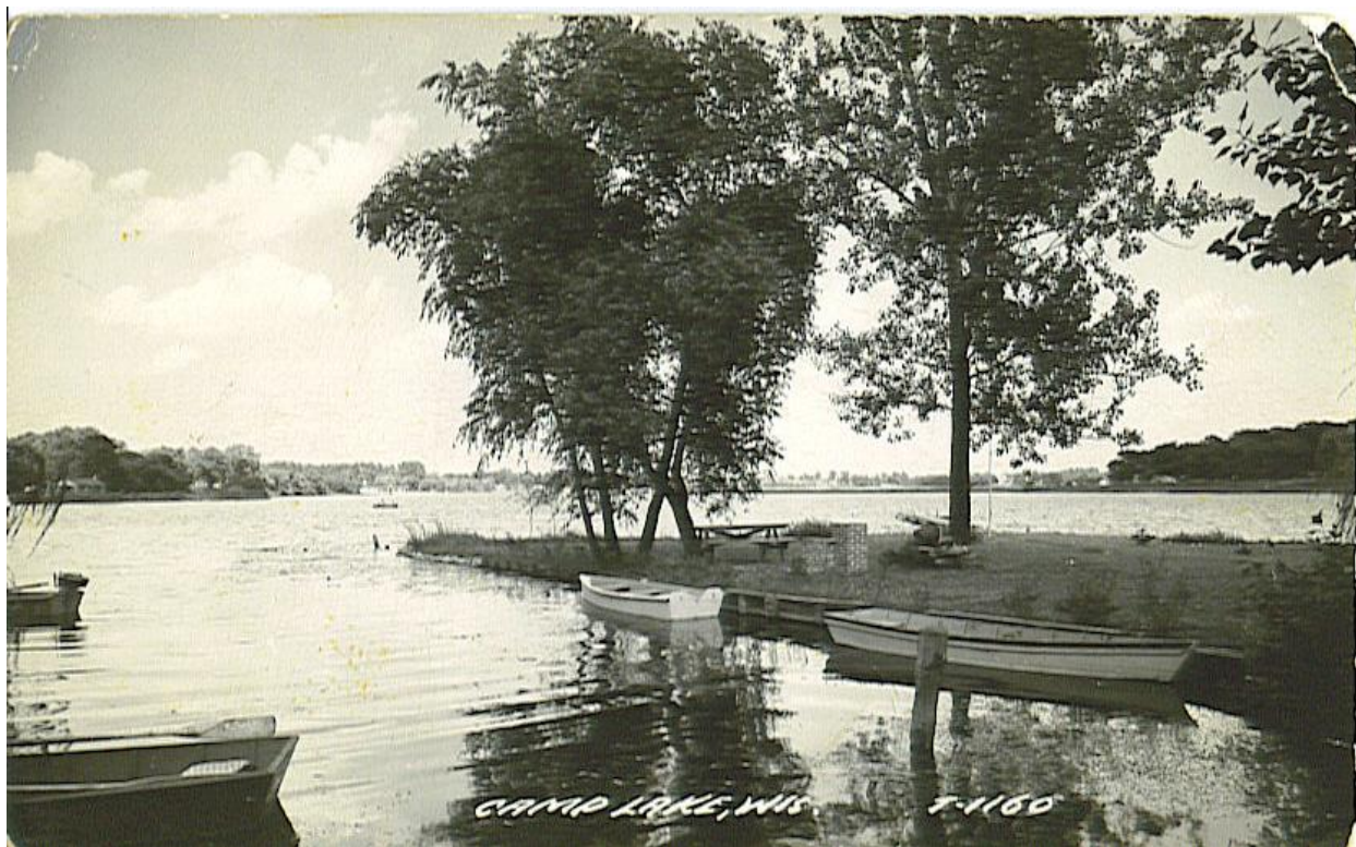
ii jcr FROM lakeside of 9527

274th looking into CENTER lake MANOR new HOMES in WOODS and a white BLDG in distance left of CTR and houses on LEF TT1160LL cook