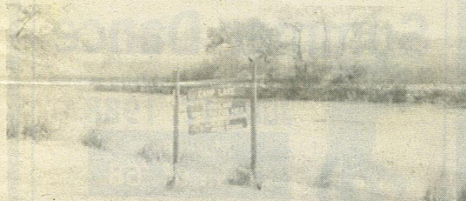
This channel in Camp Lake is so full of weeds, boats have a difficult time getting through. The Lake Management District

hopes to clean the lake in the near future to take care of this problem.