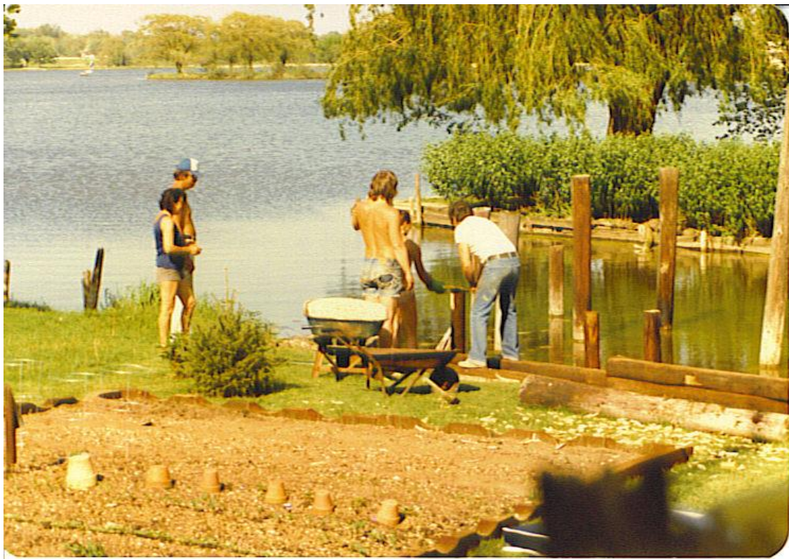
ii JCR Putting in Pier at 9527 in Center Lake manor