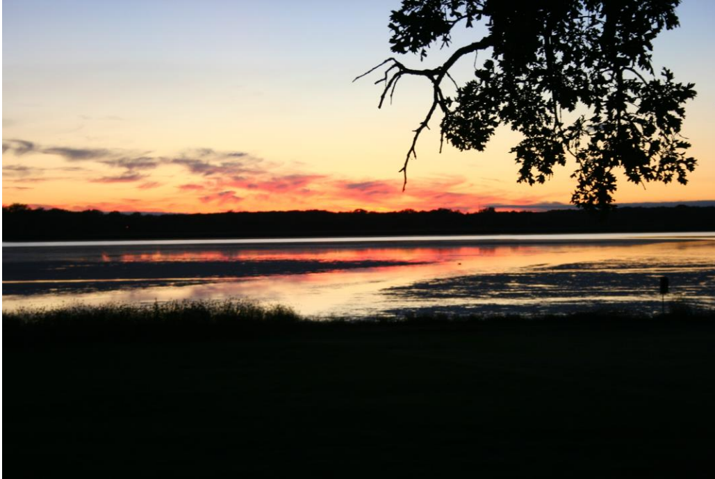
ii IMG_0445 sunset on camp lake 8-24-2005 10-05-28 AM 3456x2304

~ 1988 July 16 1988 Camp Lake Oaks Community Hall CCLRD report that the Scientific Aquatic Weed Control accomplished the weed spraying July 11 but did not do the channels due to low water levels and did not go into some of the areas which had been approved by permit; chemical had been approved by the EPA; Cost was $5,553.00 but only one of the two approved sprayings will occur; discussion about sediment becoming deeper in the lake; water testing has not been practiced but will be included in the Management plan once the DISTRICT is formed; discussion about weed harvesting and dredging to control weeds; and 'restricted lake use' has introduced that the State and Federal funds for rehabilitation and State fish stocking would not