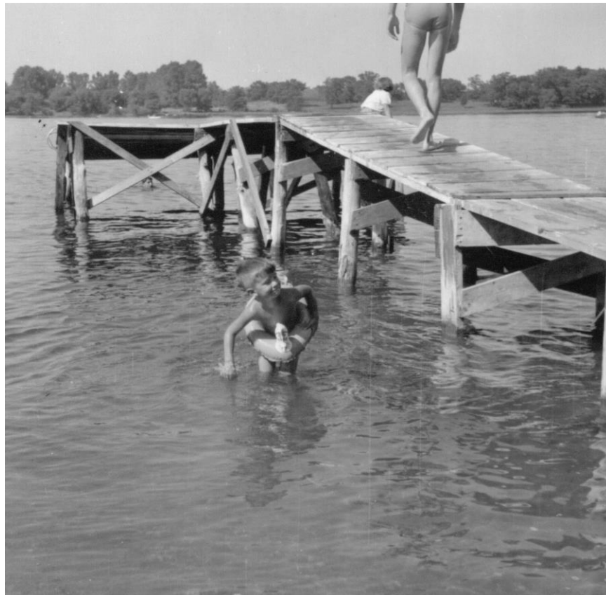
ii 05The Beach 2CLW

~ 1967 October 14 1967 CLWPOA decides to purchase a bicycle rack for the beach. CLWPOA-169