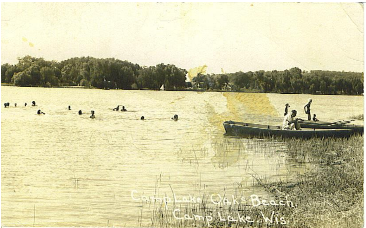
ii rwc Camp Lake Oaks Beach Camp Lake Wi looking to YAWS