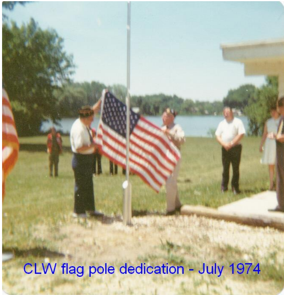
CLW flag pole dedication - July 1974