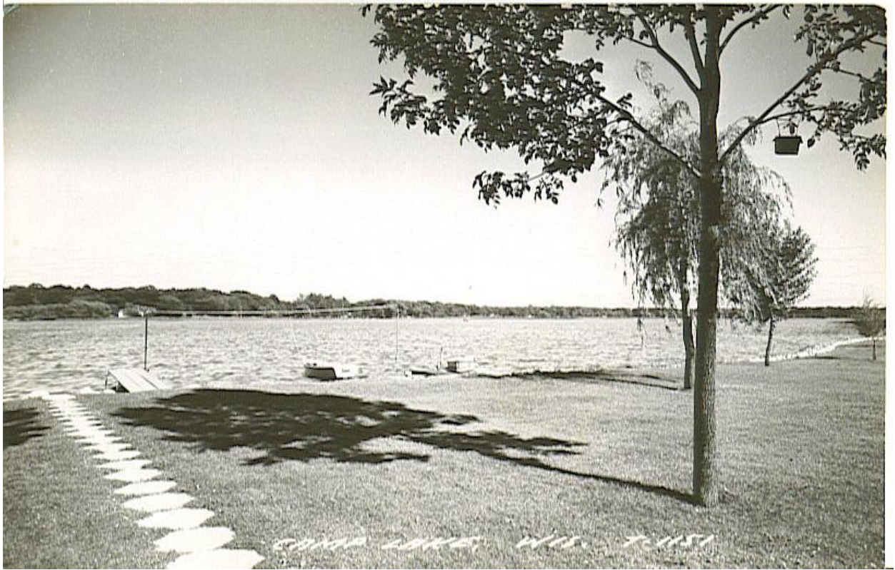
ii jcr 0000view toCamplakeOAKS from about Lakeside from LLcookT1151