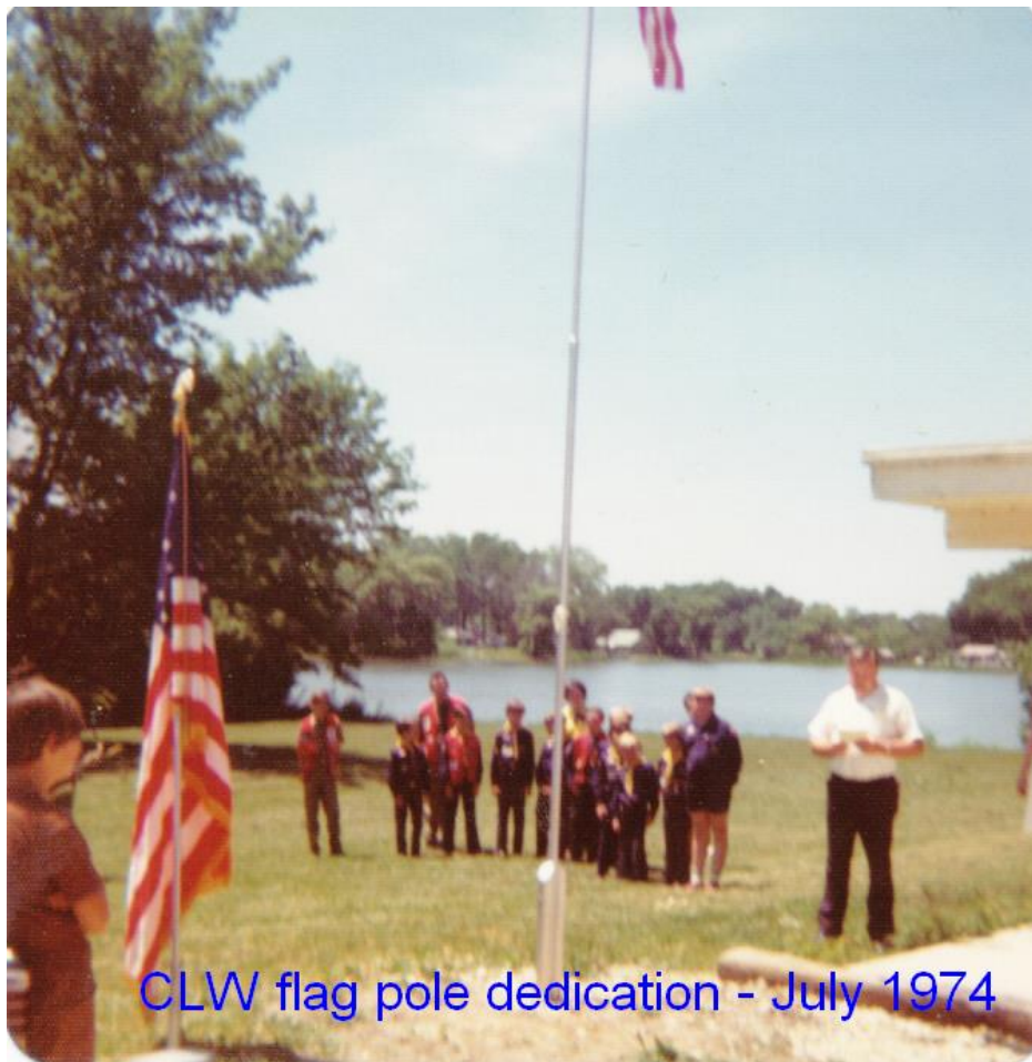
CLW flag pole dedication - July 1974

~ 1974 August 31 1974 CLWPOA investigates having a raft at their beach for the kids, to be made by their association; the vote showed 19 for and 13 opposed. CLWPOA -104, 105