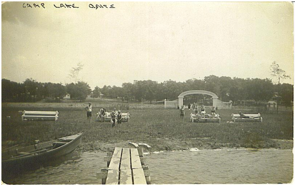
ii rwc CampLakeOaksDOCKrowBoatGatewaynoticeBENCHpartatDOCK

~ 1971 April 17 1971 CLWPOA subdivision fire cost the taxpayers who called the WRONG fire department $1,000. CLWPOA-141