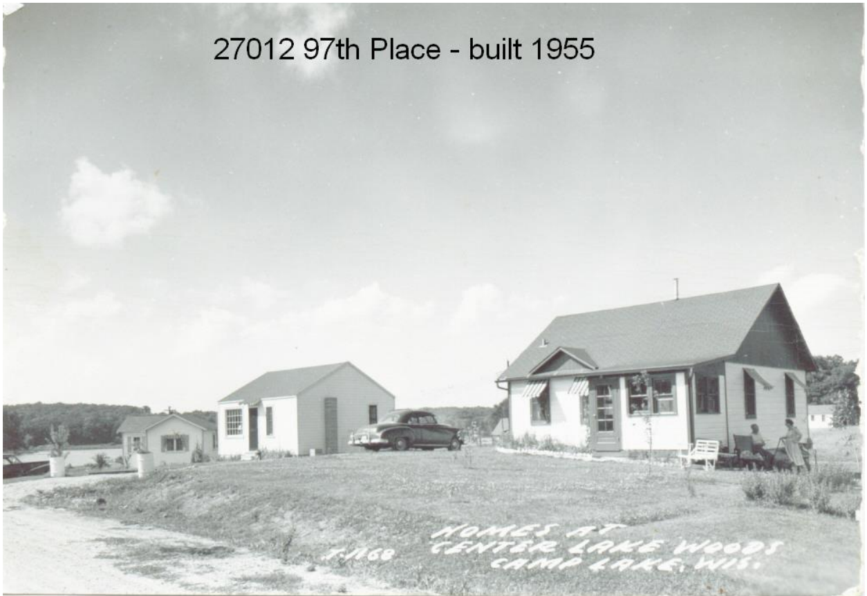
ii 27012 97th Place - 1955