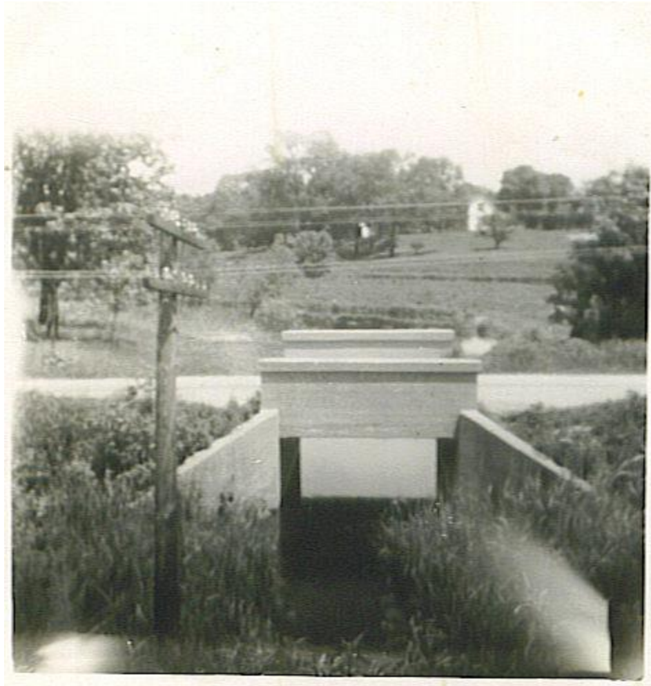
ii jcr culvert on SA between Center Lake and Camp Lake before the Railroad Culvert and wenski farmhouse 8-30-2005 4-35-48 PM 472x497