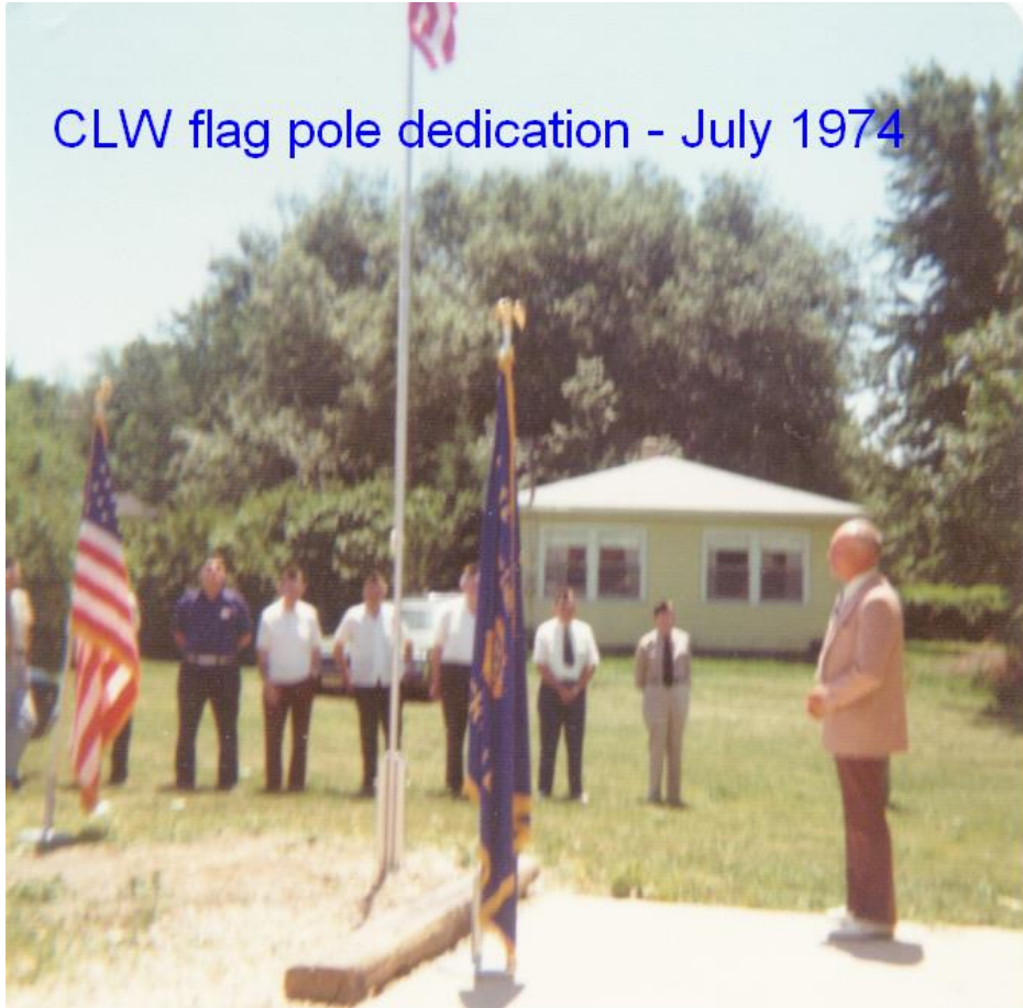
ii Flag Pole dedication 1974