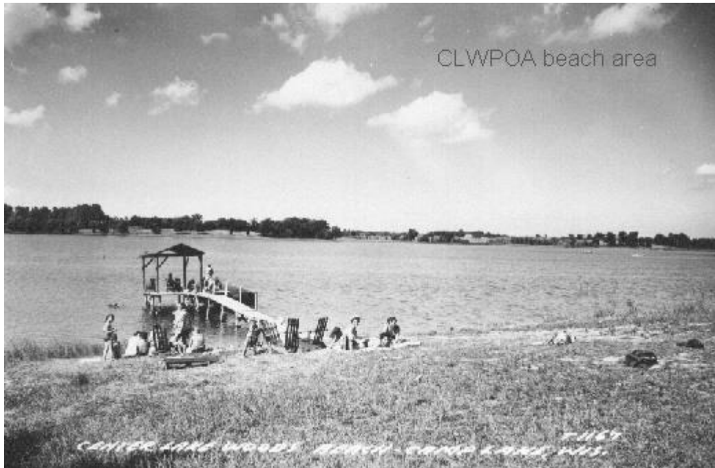
ii CLW Beach

~ 1968 Camp Lake stocking record 23,940 3 inch Walleye CCLRD1-171